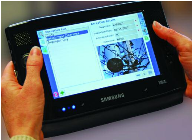
Figure 2. Field collection software running on an Ultra-Mobile PC.

revenue while minimizing your expenses. These approaches also make regulatory compliance difficult to manage.